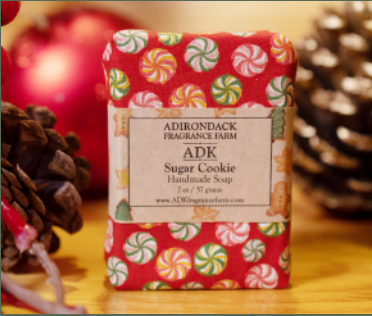
Sugar Cookie #1177