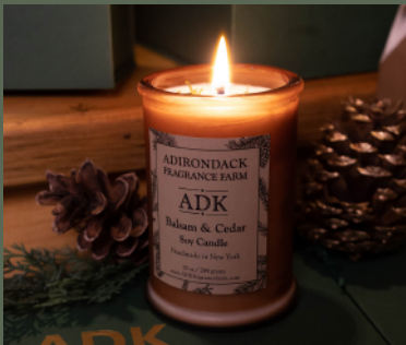
Balsam & Cedar

6 oz • $24 each 10 oz • $37 each 20 oz • $57 each