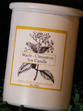
Maple-Cinnamon Soy Candle #2303 • 16 oz #2222 • 6 oz