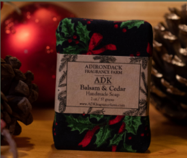
Balsam & Cedar #1175

Holiday wrapped bar soaps 2 oz • $7 each