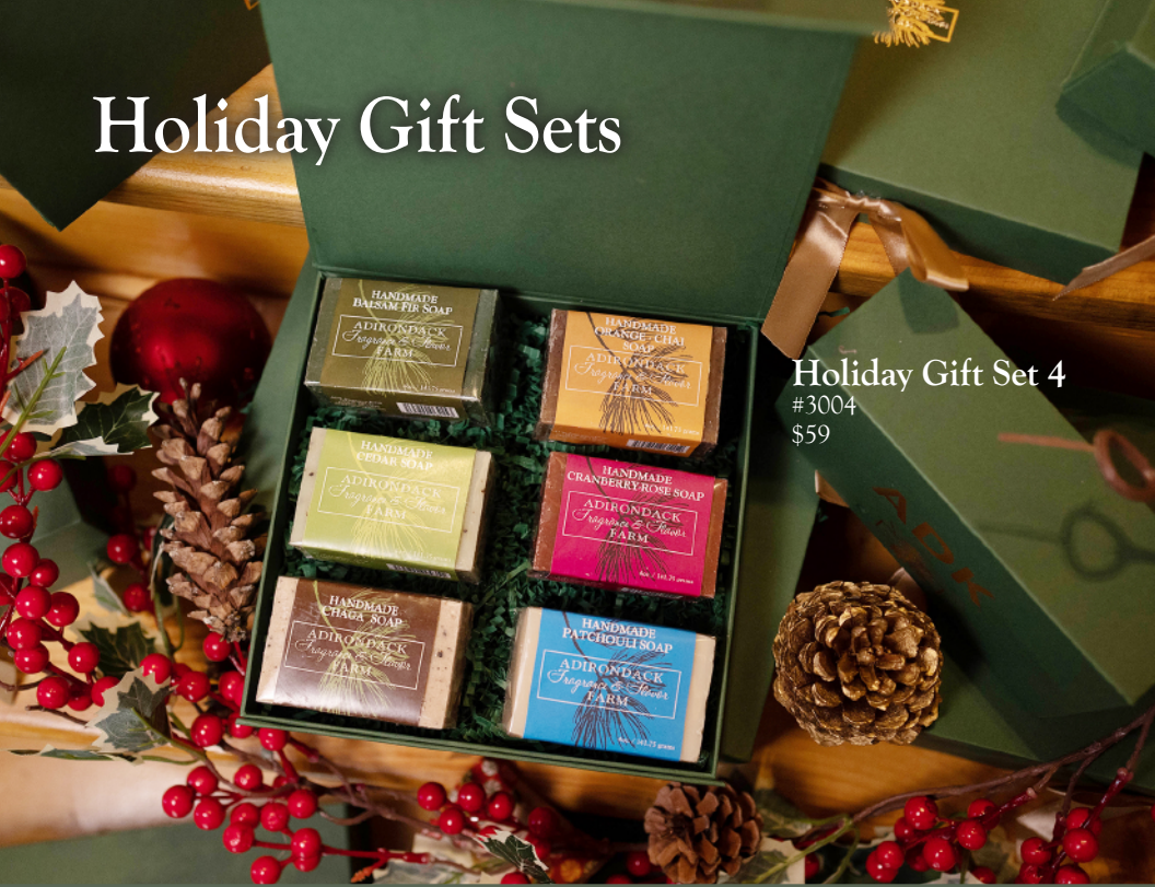
Holiday Gift Set 4 #3004 $59