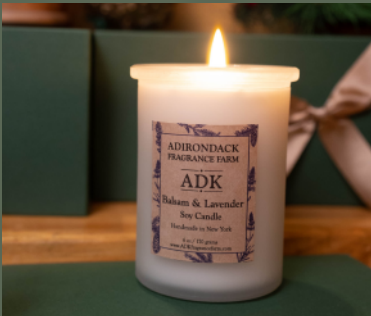
Balsam & Lavender