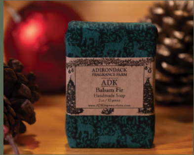
Balsam Fir #1174

Holiday wrapped bar soaps 2 oz • $7 each