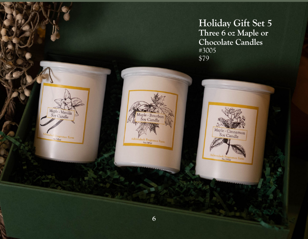
Holiday Gift Set 5 Three 6 oz Maple or Chocolate Candles #3005 $79