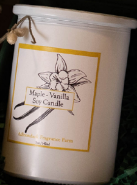
Maple-Vanilla Soy Candle #2302 • 16 oz #2221 • 6 oz