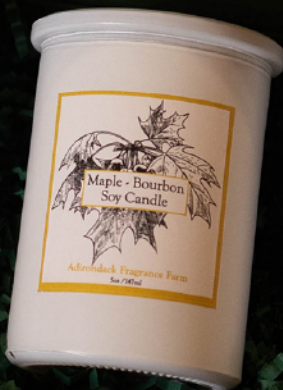
Maple-Bourbon Soy Candle #2301 • 16 oz #2220 • 6 oz