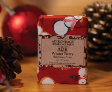
Winter Berry #1178