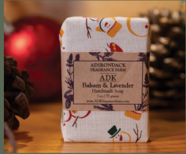
Balsam & Lavender #1176